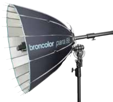
Para 88 reflector | 33.482.00