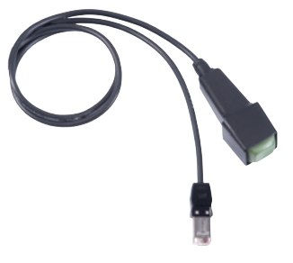
Sinar eShutter/eMotion Trigger Cable (RJ45 to Lemo Trigger-In)